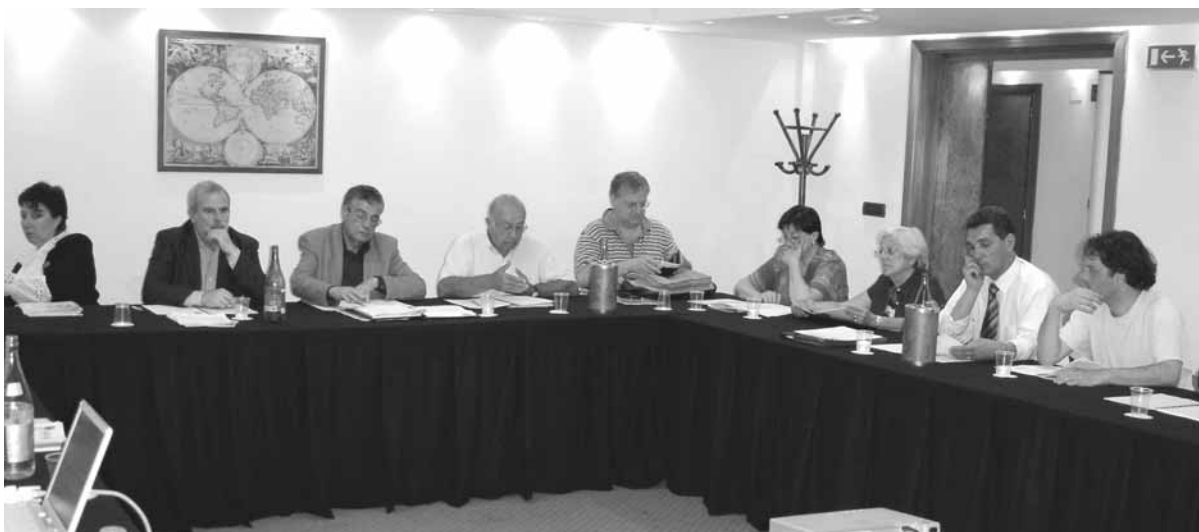
Participants at the 11 th Annual General Meeting of the IAMF

For a more detailed account of the reports and documents presented to the 11 th AGM of the IAMF, we refer our readers to our Internet site www.aifm.org where the documents can be downloaded.