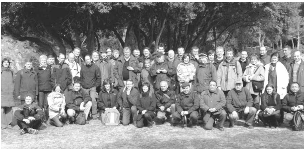
National delegates from 26 COST Action E 27 member countries on the field visit of the final conference in Barcelona - Photo Karl-Manfred Schweinzer ...

A proposal was put forward on the need to carry out an assessment of the effectiveness